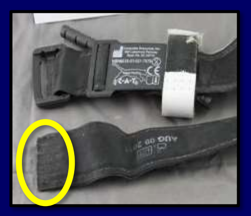
Entire tip cut off