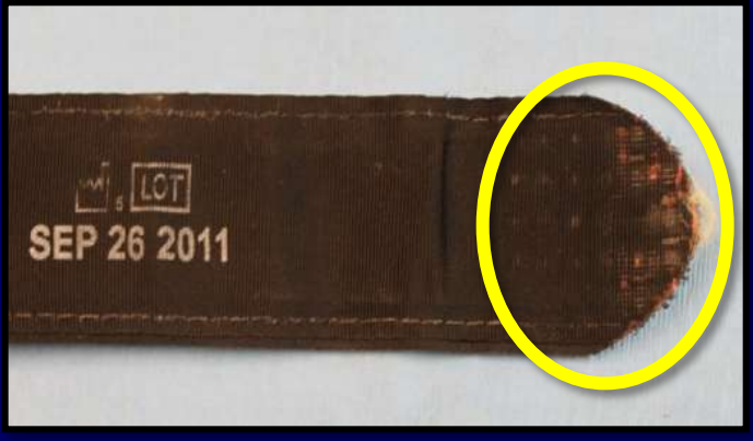
Red tip scraped off